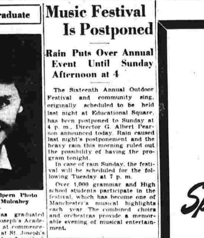
George Helms Photo